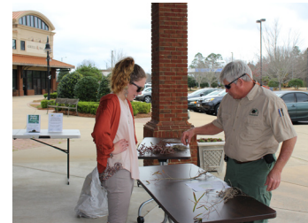
Thank you, Alabama Forestry Commission, for helping our neighbors plant trees in the Town of Pike Road!

In partnership with the Alabama Forestry Commission, we were able to give away nearly 1,000 seedlings to the Town of Pike Road community in celebration of Alabama Arbor Week. With 4 varieties including hickory and oak, these trees are a perfect addition to any yard. Thank you to everyone who participated and planted a tree in the Town of Pike Road!