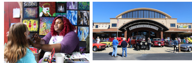
Above: Views from the 7th Annual Pike Road Art Market.